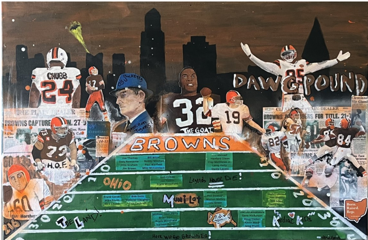
Above image: N8tivegenius Legends Never Die Acrylic and mixed media on canvas